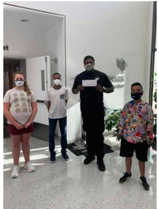
Newmark donates $1,000!