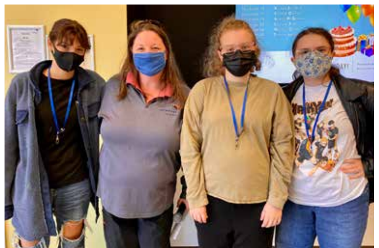
PINs Ceremony November 2021