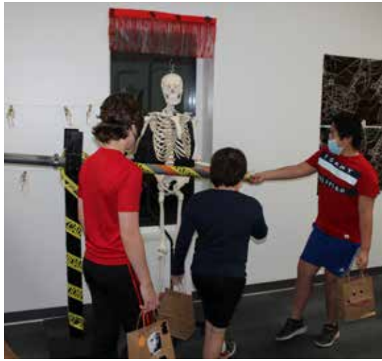
Trick-or-Treating down Main street