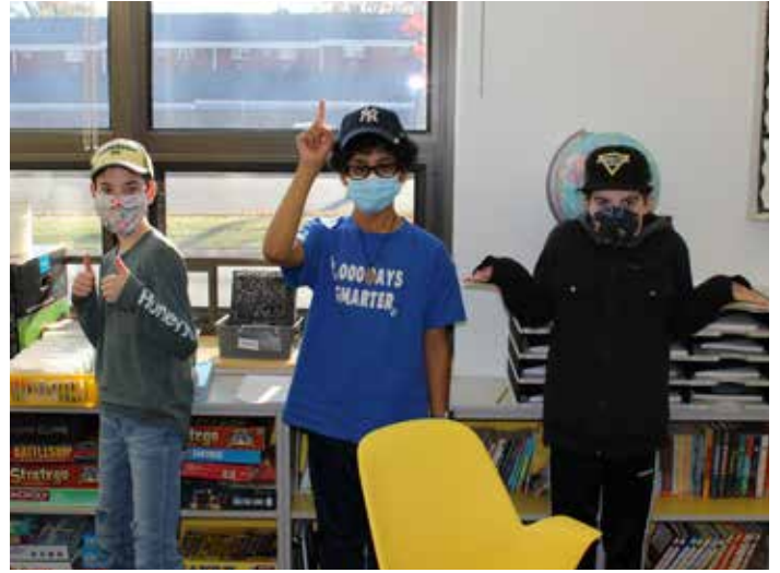
Favorite Hat Day!