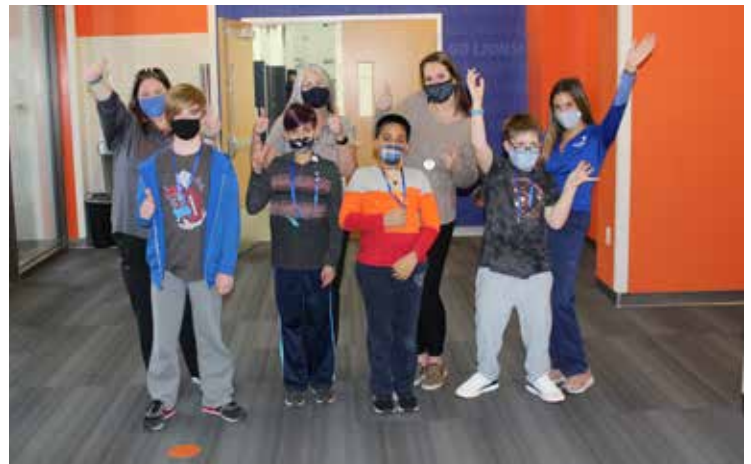
PINs Ceremony November 2021

https://www.newmarkeducation.com/our-schools/pins